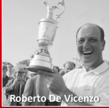
Roberto De Vicenzo

21 If your enemy is hungry, give him food to eat, and if he is thirsty, give him water to drink, 22 for you will heap burning coals on his head, and the LORD will reward you.